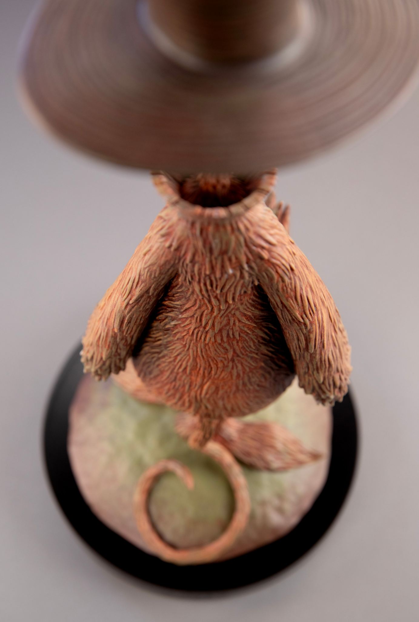
PLEASE CONTACT YOUR ART CONSULTANT FOR DETAILS ON HOW TO ACQUIRE THIS RARE WORK